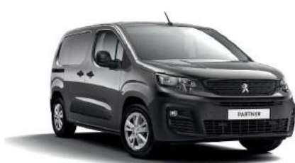
NIMBUS GREY (M)