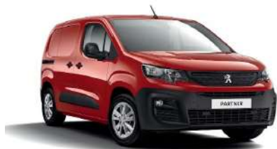
ARDENT RED (F)