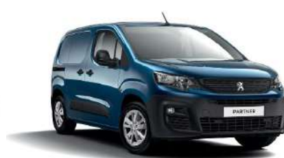
DEEP BLUE (M)