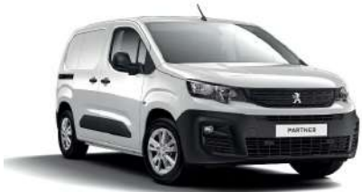
BIANCA WHITE (F)