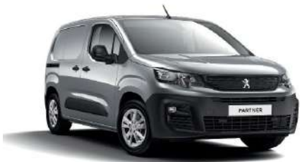
CUMULUS GREY (M)